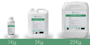
TYPES OF PACKING

Plastic packaging made of HDPE material.