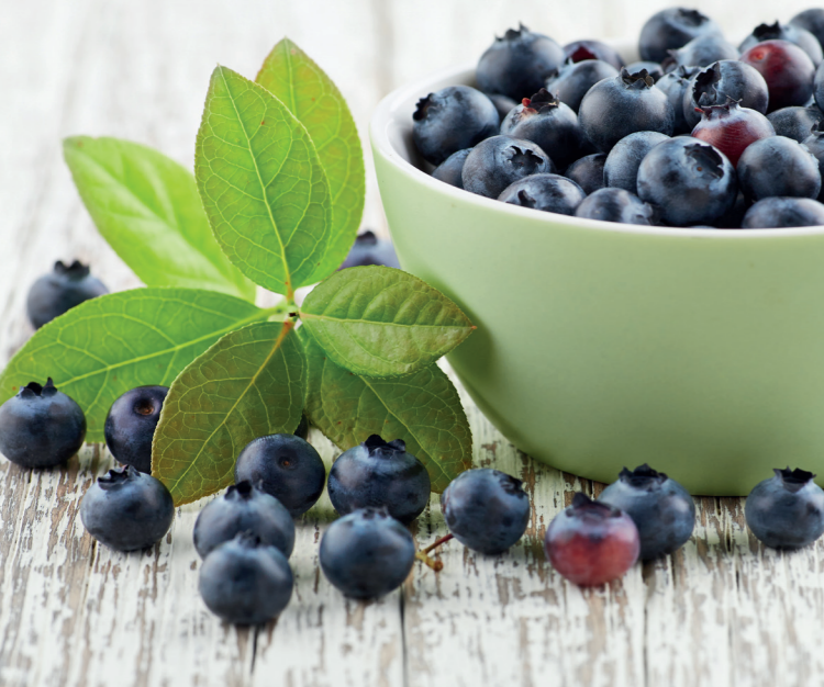
Blueberries Fruit Extract Vaccinium myrtillus extract