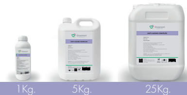
TYPES OF PACKING