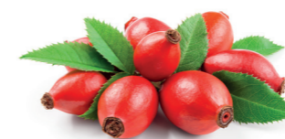
Rosahip Fruit Extract Rosa canina fruit extract Rich in antioxidants. Thanks to these compounds, it can protect skin cells by fighting free radicals and helps reduce the formation of under-eye dark circles and swelling.