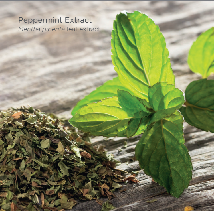
Peppermint Extract Mentha piperita leaf extract