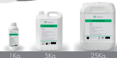
TYPES OF PACKING