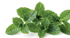
Peppermint Extract Mentha piperita leaf extract It cools the skin and helps relieve under-eye bruises and swelling.