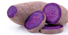
Purple Potato Extract Dioscorea alata extract Thanks to its anti-inflammatory properties, it helps reduce swelling and inflammation under the eyes.