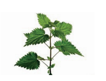
Common Nettle Extract Urtica dioica leaf extract

It helps to strengthen and thicken the hair. It nourishes and strengthens the hair follicles and also helps to protect the oil balance of the