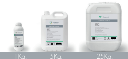
TYPES OF PACKING