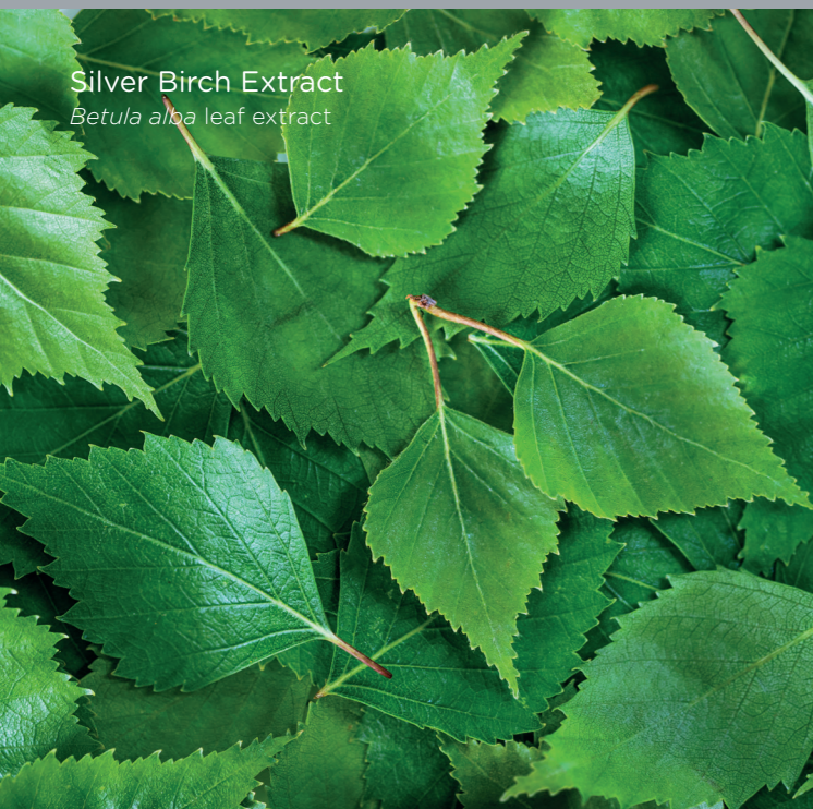
Silver Birch Extract Betula alba leaf extract