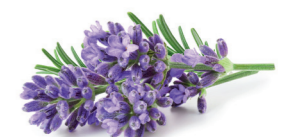
Lavender (English Lavender) Oil Lavandula angustifolia oil

It has a helpful effect on healing and moisturising damaged cuticles. It supports the reduction of nail brittleness and prevents peeling.