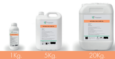
TYPES OF PACKING

Plastic packaging made of HDPE material.