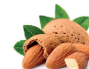
Sweet Almond Oil Prunus amygdalus oil

It supports the reduction of nail yellowing. It has a supportive effect on softening dry cuticles, strengthening nails, and preventing breakage.