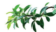
Tea Tree Oil Melaleuca alternifolia oil

By moisturising and strengthening the nails, it supports their durability. It helps prevent nail breakage and peeling, resulting in stronger, healthier nails.